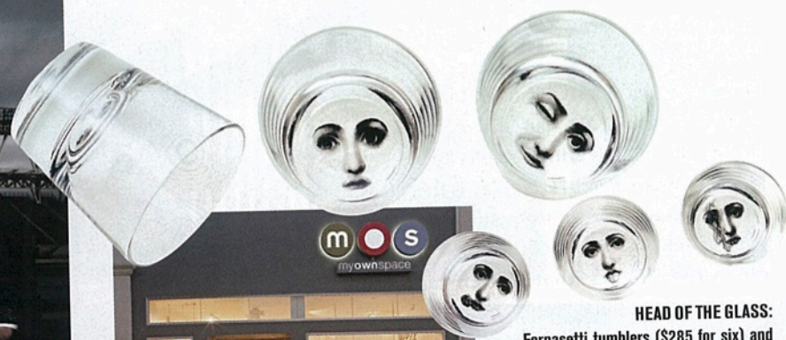
HEAD OF THE GLASS: Fornasetti tumblers ($285 for six) and the Adam Plates ($1,995-$3,200).